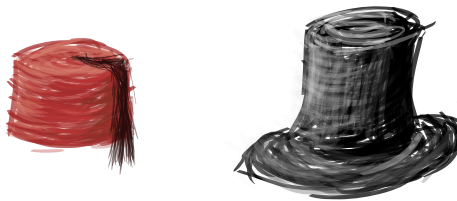
Figure 2: A small subset of The Wizard’s Hat Collection. Other notable hats include a bicorné, a bowler, a panama hat, and a kolpik.